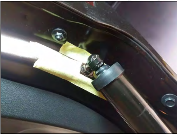
3. Install our brace rod with the right upper ball head of the original car.