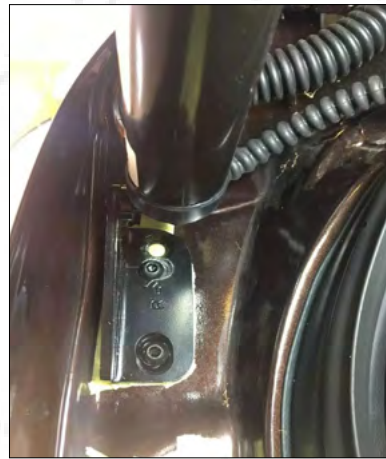
4. Remove the left lower bracket and the brace rod. Then install our left lower right bracket.