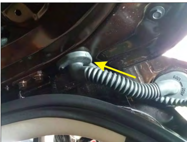
7. Pass the cables from the original car rubber plug (the left and right steps are the same).