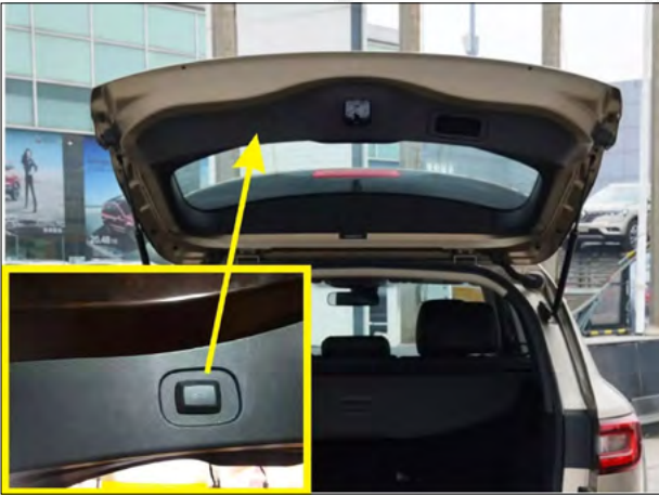
16. Drill a hole on the tailgate and install our tailgate switch button.