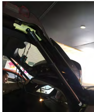
6. Brace rod installation completed diagram.