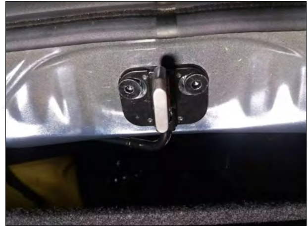
17. Remove the original car lock and install our electric suction lock.