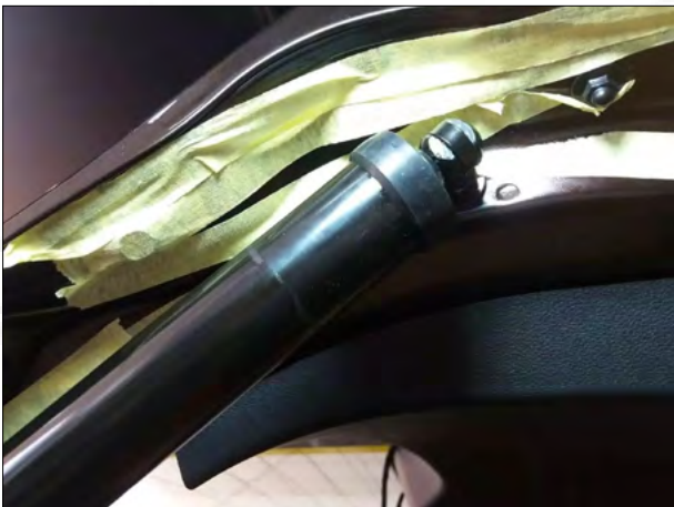
5. Install our brace rod with the left upper ball head of the original car.