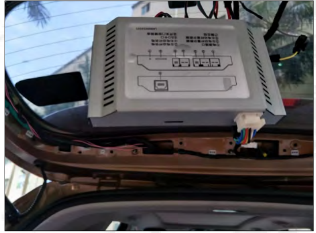
15. According to the color, insert the plug into the control box.