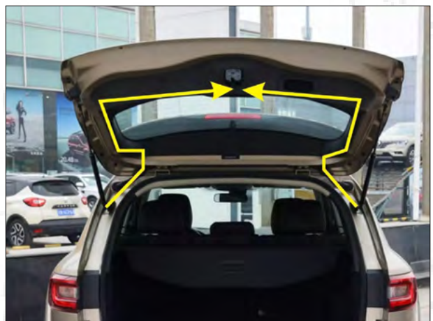
8. Routing the cables through the rubber plug to the tailgate trim panel.