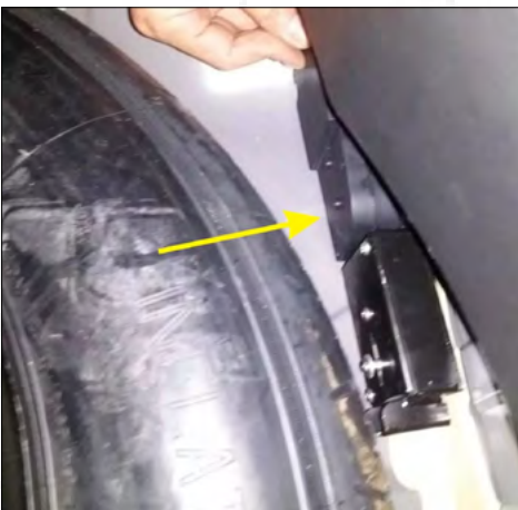
18. Install the motor next to the spare tire and fix it with our 3M paste.